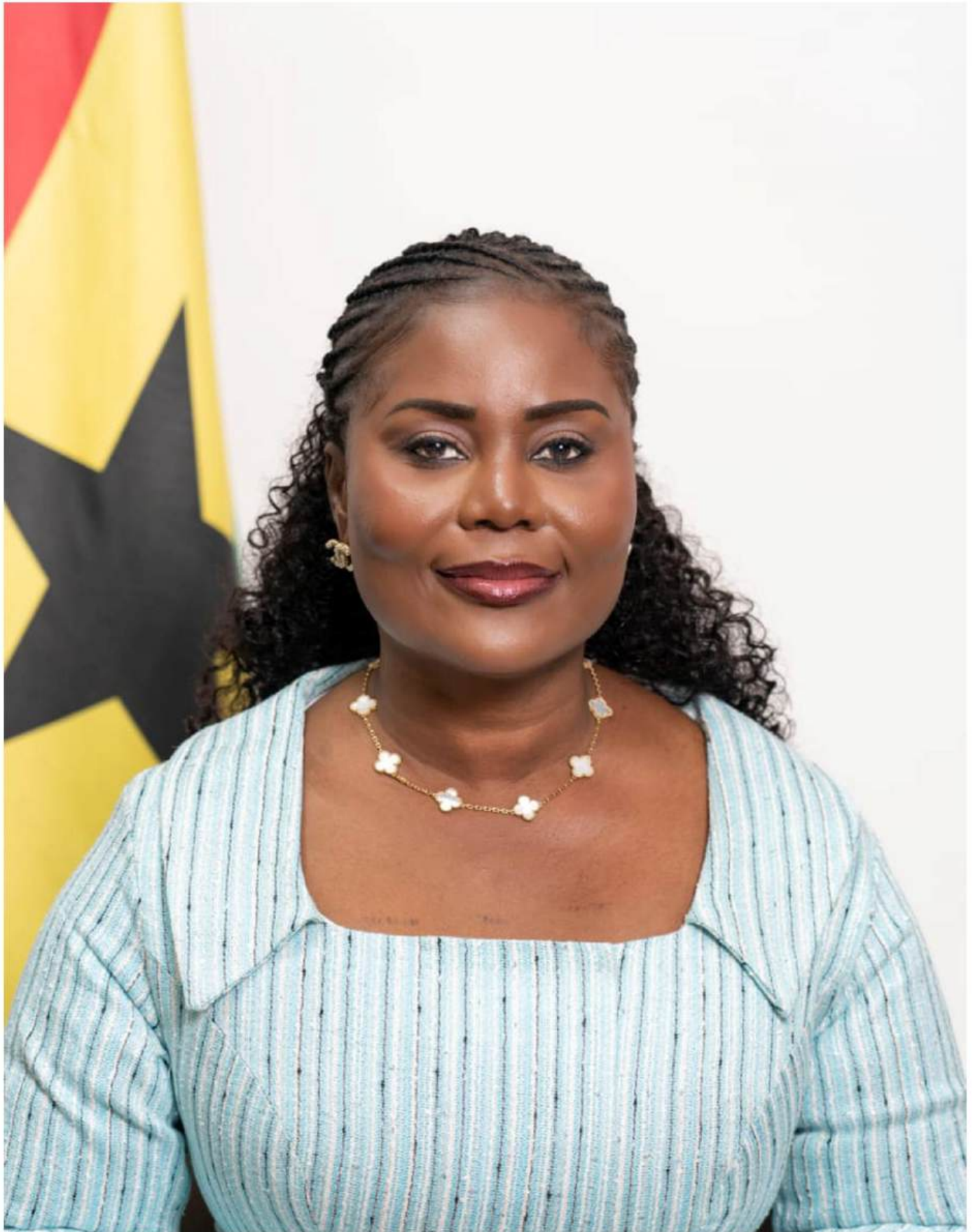
HON. DORCAS ATTO-TOFFEY DEPUTY MINISTER OF TRANSPORT