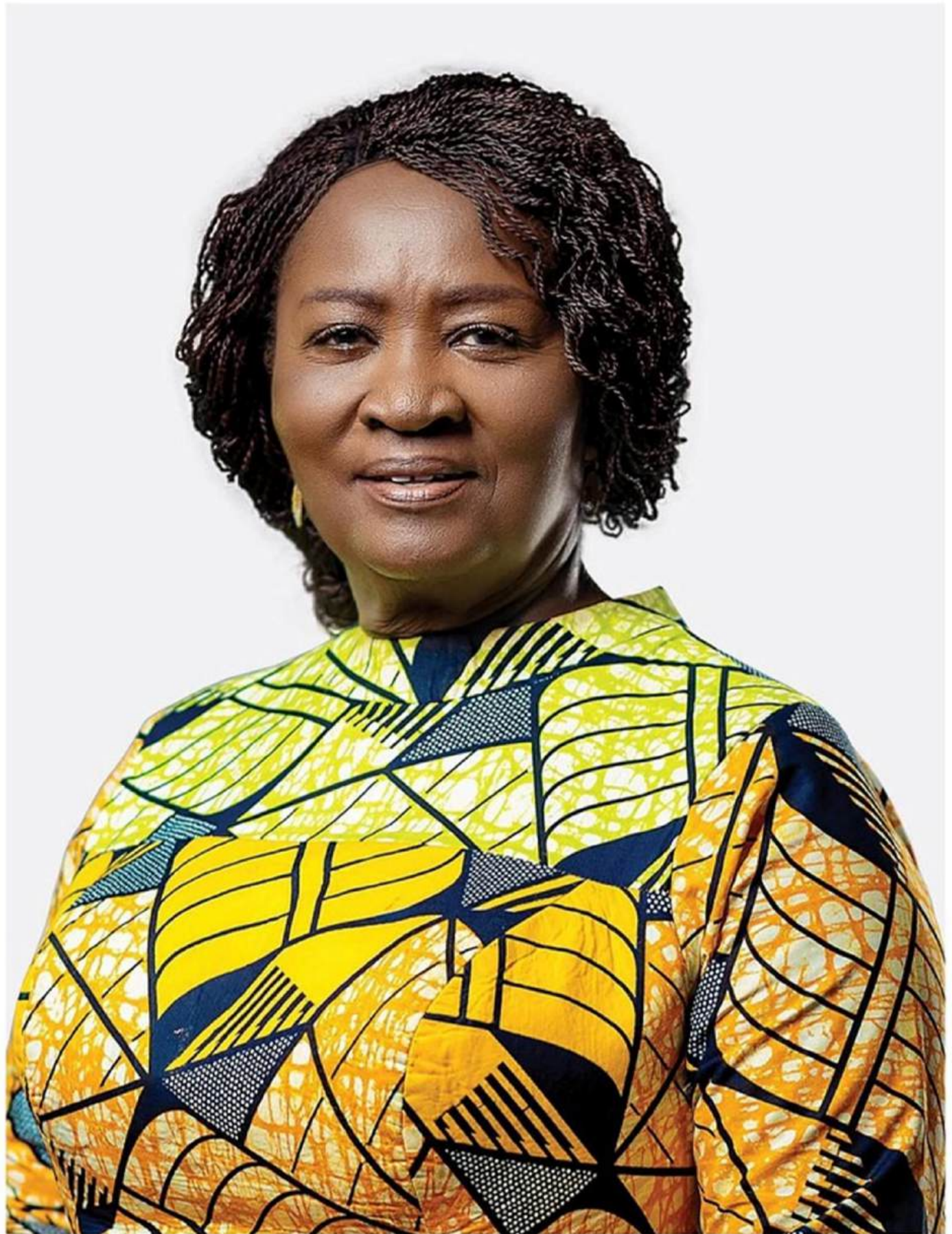
HE NAANA JANE OPOKU-AGYEMANG, PHD, FGA VICE PRESIDENT OF THE REPUBLIC OF GHANA