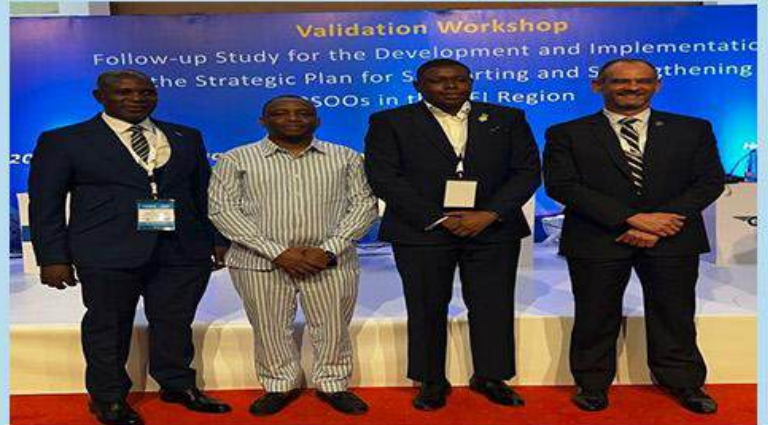
Aviation Safety Stakeholders from across Africa emphasized that Stronger Collaboration Remains essential for the growth and Sustainability of Regional Safety Oversight Organization (RSOOs) and Regional Accident and Incident Investigation Organizations (RAIOs)