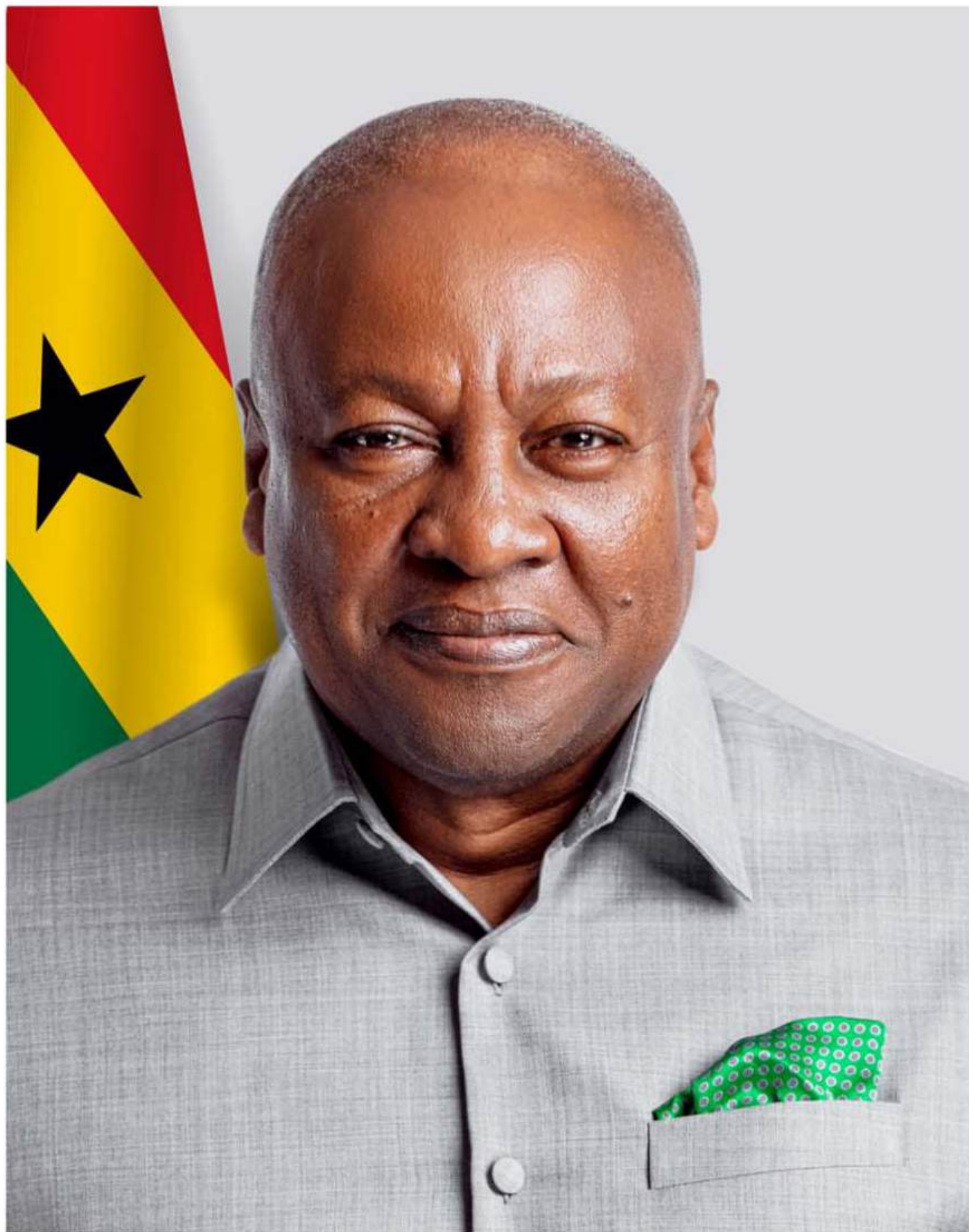
HIS EXCELLENCY JOHN DRAMANI MAHAMA PRESIDENT OF THE REPUBLIC OF GHANA