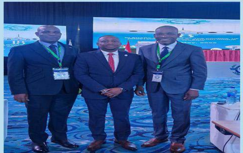
The Banjul Accord Group (BAG) marked a significant milestone in regional aviation cooperation with a successful three-day Plenary Session and Council of Ministers meeting hosted by the Nigeria Civil Aviation Authority (NCAA). The event brought together delegates from all seven BAG member states, Nigeria, Ghana, Liberia, Guinea Conakry, The Gambia, Cape Verde, and Sierra Leone