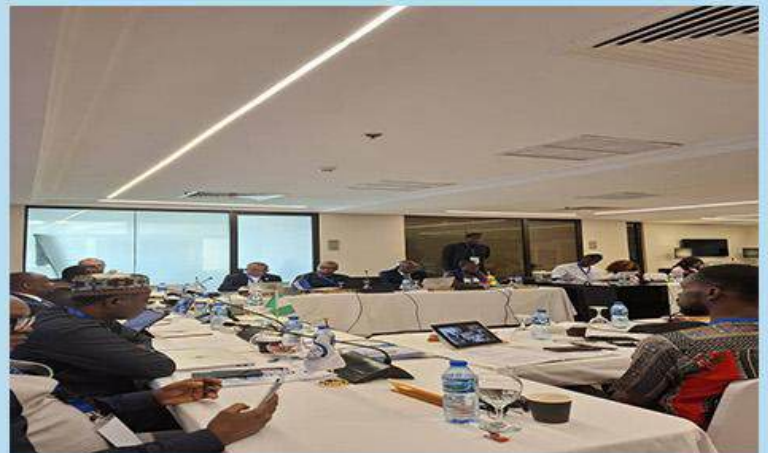
BAGAIA holds Commission Meeting in Abuja and Inaugurates new Board of Directors to Strengthen Regional Aviation Safety