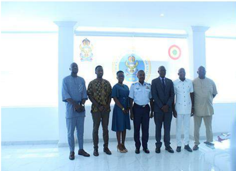
AIB Ghana Delegation and Air Force Staff