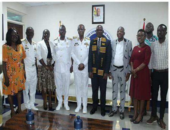
AIB Ghana Delegation and Naval Staff