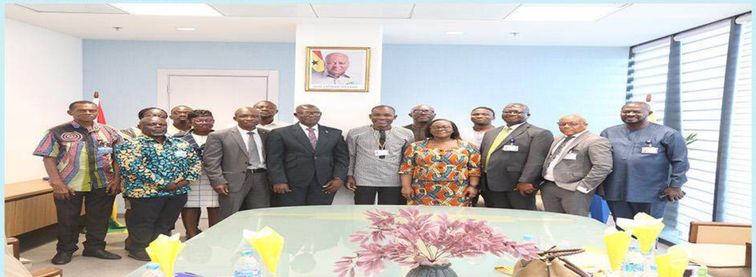
AIB Ghana Delegation with the Management Team of GCAA

The familiarization visit concluded on a note of mutual respect and commitment, with both organizations pledging to continue working hand in hand to promote a safer and more resilient aviation sector.